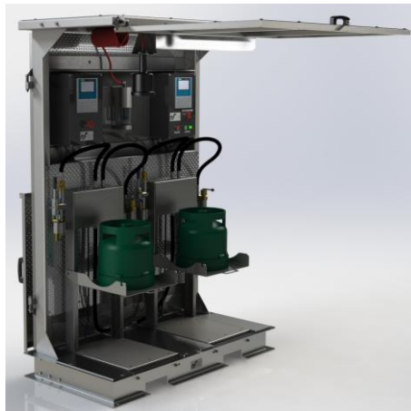
SB1B filling skid (with 2 electronic scales)