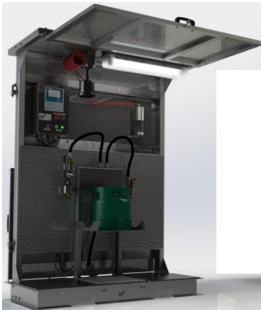
SB1A filling skid (with 1 electronic scale)