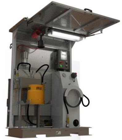
SB1A (1 filling scale + 1 Autogas filling POD)

This skid consists of a steel frame and aluminium panels on hinges that can be padlocked for securing the following equipment: