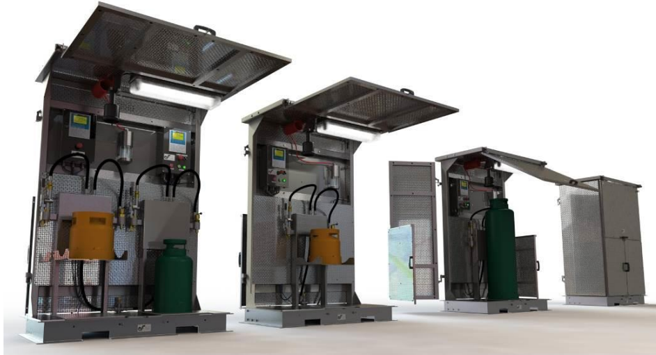
The enclosure can be closed or opened completely and is equipped with a foldable roof