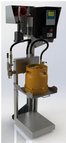
Typical electronic scale